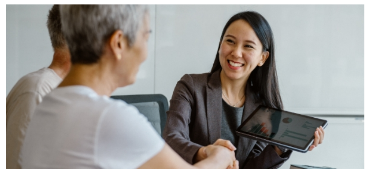
Women face different retirement challenges than those of men.

Women have longer retirements. Women typically live about five years longer. They may need to plan for an extended retirement and expect to live alone without a shared income.